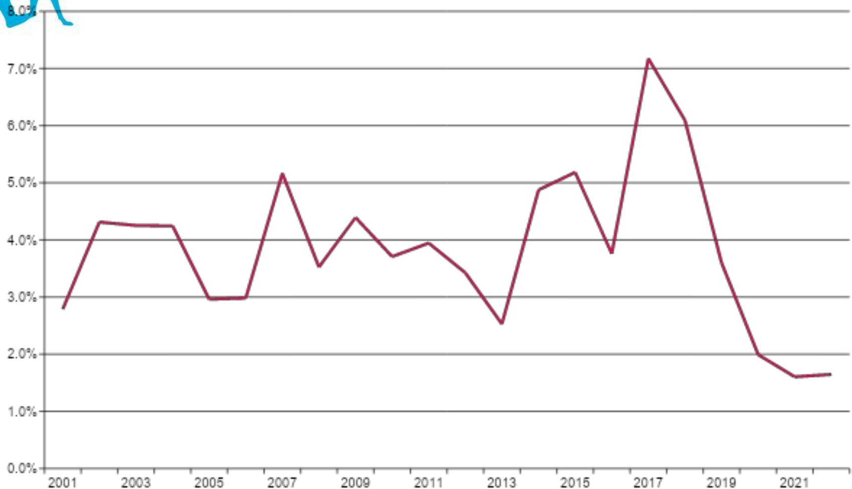
Percentage of PRP's with entropion repair